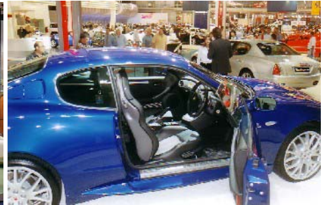
New GranSport in a bright blue