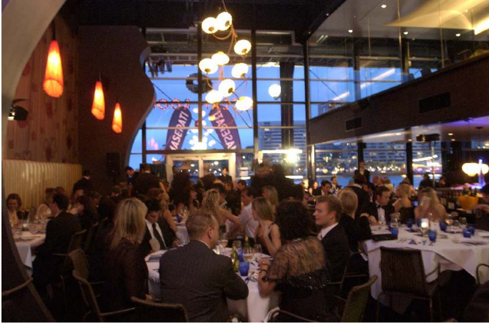
The wonderful Ocean Room was our venue for the Maserati Club 2004 Gala Christmas Dinner